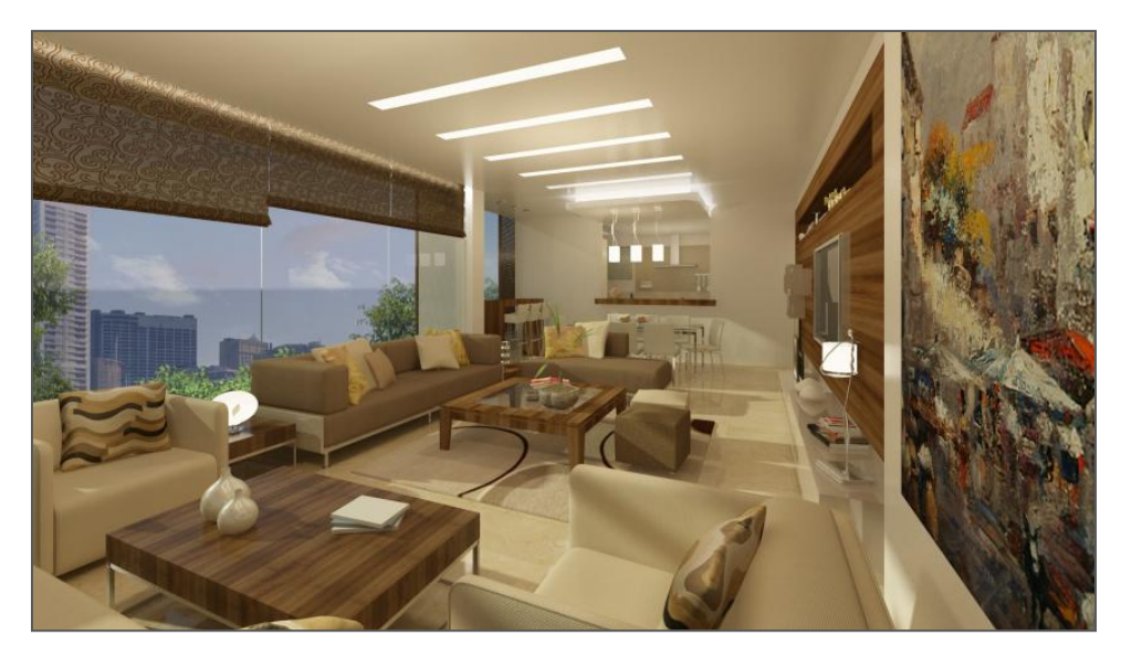
The Beirut-based real estate research firm RAMCO revealed the average apartment prices in Beirut vary between USD 2,088 and USD 7,000 per square meter.

(BEIRUT, LEBANON) — Beirut-based real estate advisory firm RAMCO revealed the average sales prices of apartments under construction in Beirut vary between USD 2,088 and USD 7,000 per square meter.